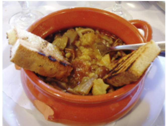
in Trastevere, Roma Sparita - Creative Commons.

In a large saucepan, saute the mushrooms, garlic, onion, and carrot in a bit of olive oil. When everything is a golden brown, sprinkle in 1 tbsp of flour and then add the tomato paste. Add the beef stock, stir well. Salt and pepper to taste. Traditionally, you would place a piece of the toasted, crusty bread into the bottom of your bowl, and pour the soup over top to serve. Top with grated Romano cheese, garnish with parsley.