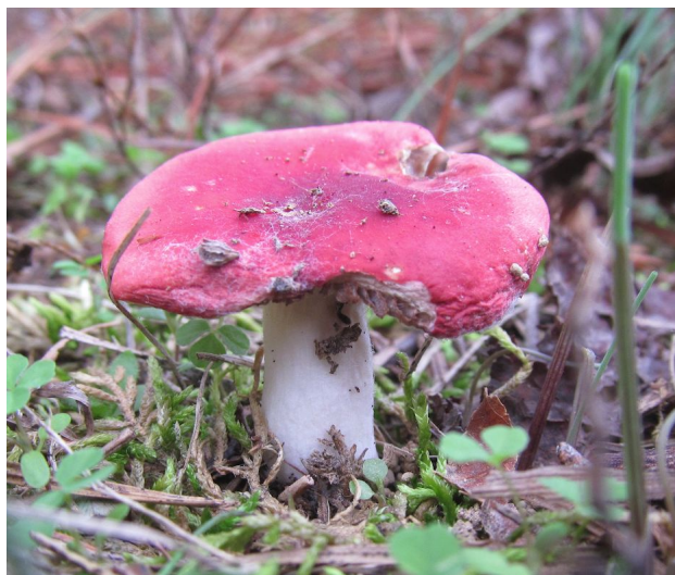
One of Alabama's many Red-capped Russula

I hope you enjoyed the first issue of the AMS newsletter. Is there something you would like to see included each month? Do you have foray photos, a recipe or something else you would like to contribute? Reach out to us at <Almushroomsoc@gmail.com>