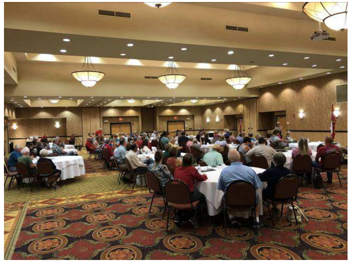
A Full House