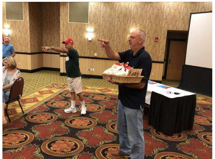
You Just Bought This