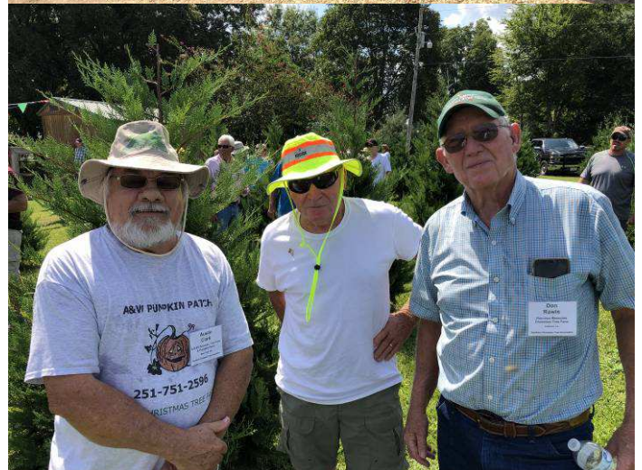
We do it our way.