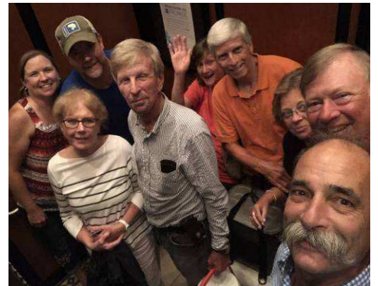
Seriously, where are the parents?