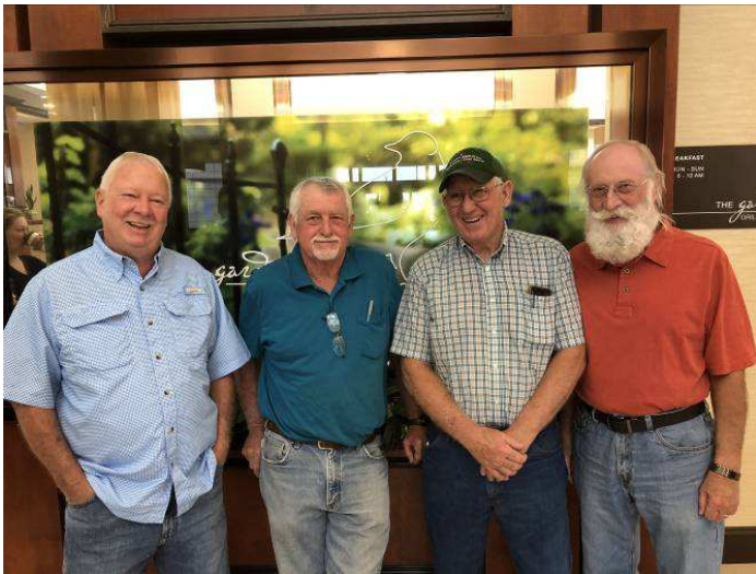
Suuuuthern Farm Boys