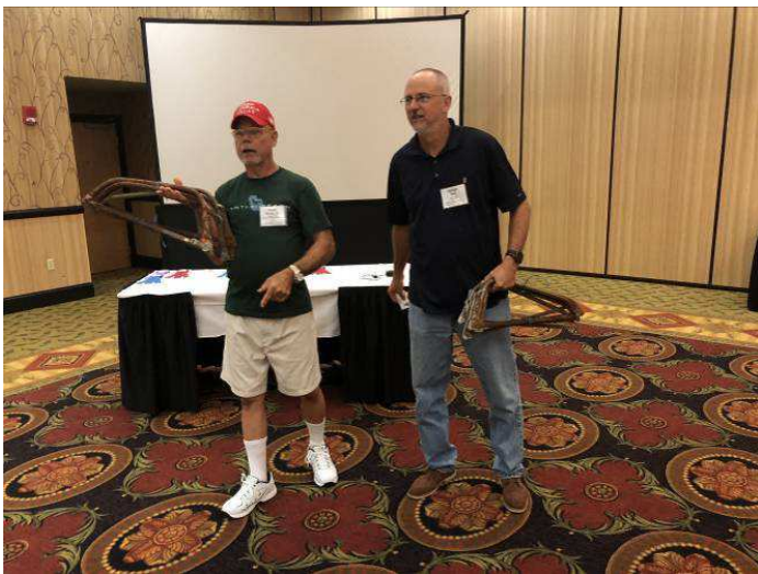
They Will Move Anything