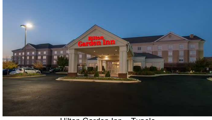
Hilton Garden Inn – Tupelo

The meeting registration form was not available for this newsletter but will be emailed soon and posted on <a href="www.SouternChristmasTrees.org">www.SouternChristmasTrees.org</a> and Facebook pages: "Southern Christmas Tree Association" and "Southern Christmas Tree Growers". Please check the website regularly for updates.