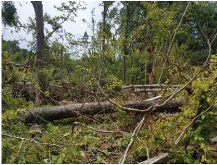
We helped this landowner salvage timber damaged by a windstorm. The landowner will re-invest the timber sale revenue to make improvements of turkey habitat and security measures.