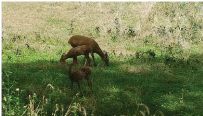
Many of our clients are interested in managing for white tail deer habitat and timber production. We have coordinated group selection harvests, crop tree release, early successional burning, and a mid-rotation herbicide in pine plantations to help them reach their goal.