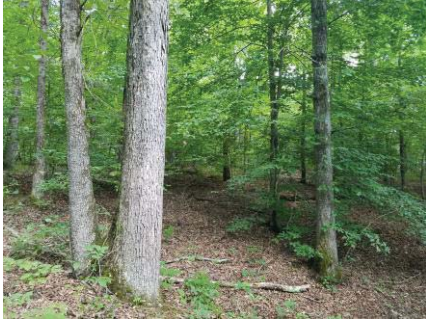
FMS helped this landowner receive more than $4,000/acre for their timber in north Alabama. White oak prices remain extremely high at this time.