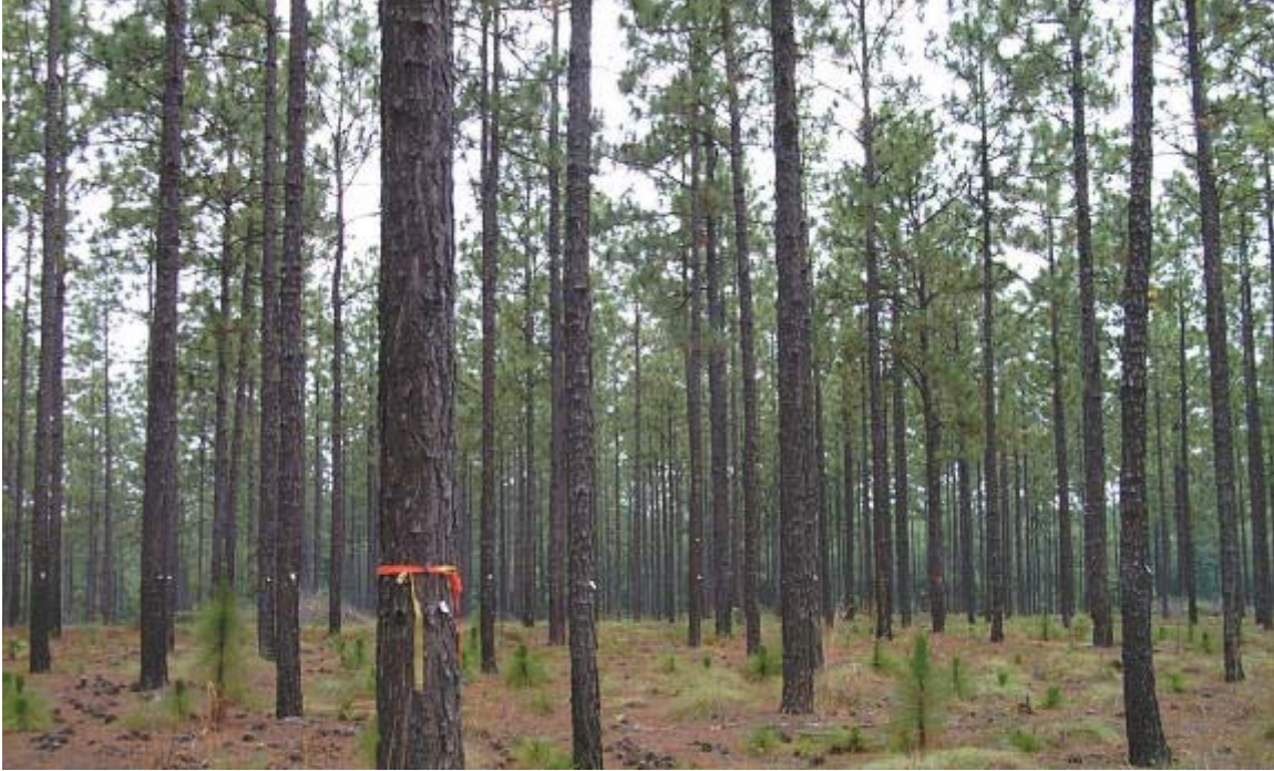
Photo 1. Longleaf stand (38-years-old) on the Sand Hills State Forest in Chesterfield County, SC, thinned twice growing on excessively well drained low fertility deep sand. Stand has been producing pine straw and is anticipated to produce some poles and quality sawtimber.