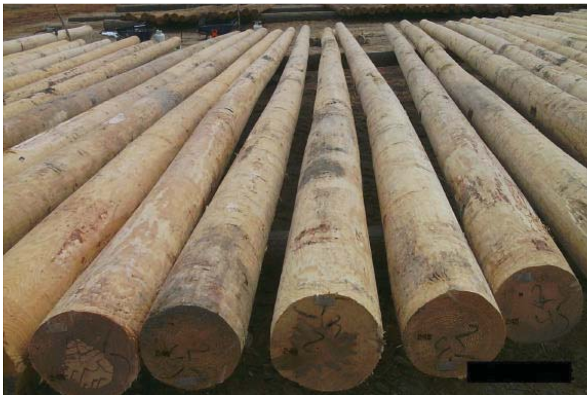
Photo 10. Pine poles at a plant in Vidalia, Georgia.

Warnell School of Forestry & Natural Resources Athens, Georgia 30602-2152