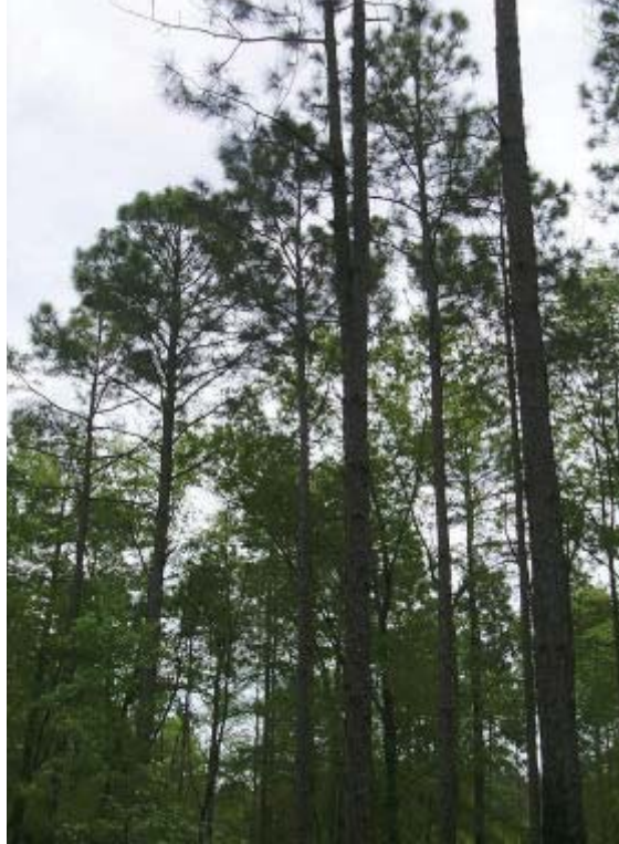
Photos 3 and 4. Examples of excessive sweep and a fork defect (stem up to fork could be used as a pole).