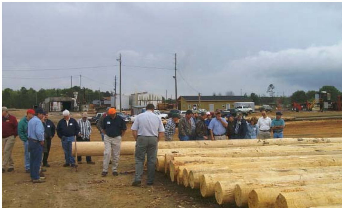
Photo 9. Pine poles at a plant in Vidalia, Georgia.