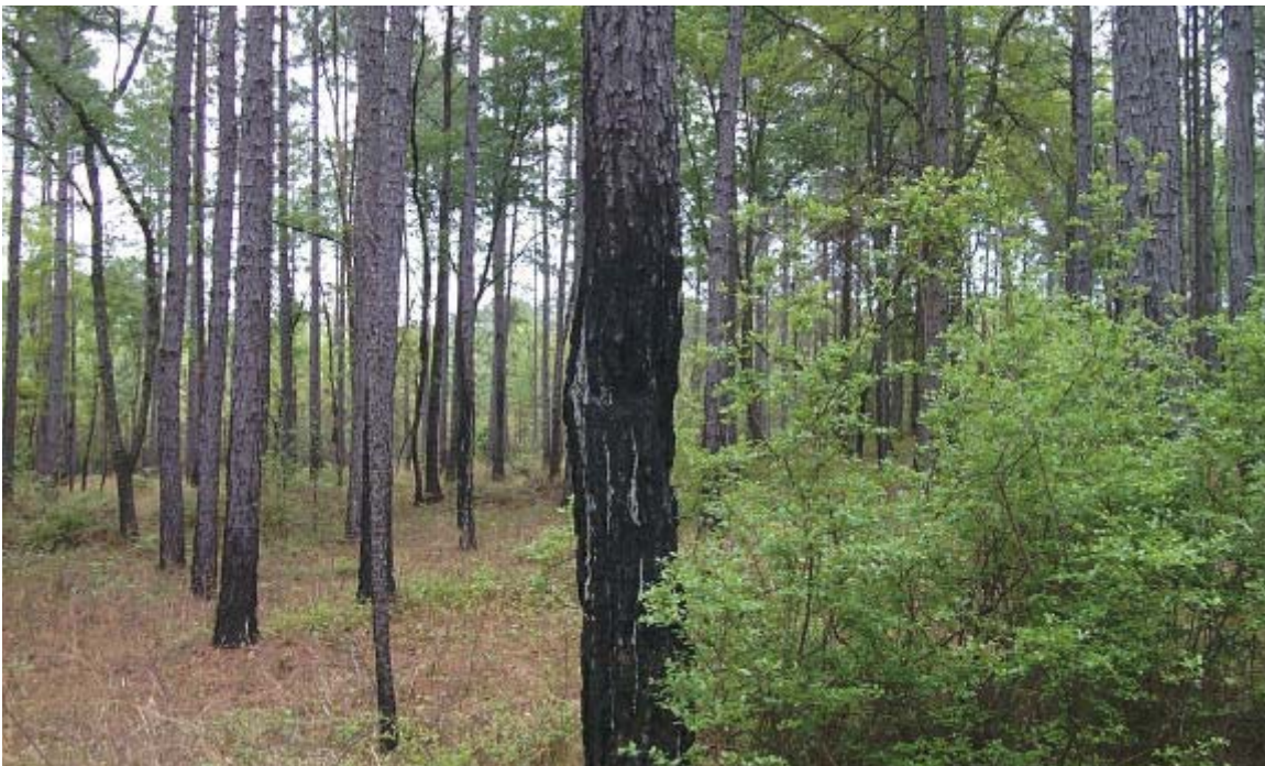
Photo 2. A managed slash pine stand (approximately 30-years-old) in Treutlen County, GA. The stand has been thinned with the objective of growing high valued sawtimber and poles. Note the stem cankered tree in the foreground that would need to be cut above the canker to possibly produce a pole. Note also the lack of branches the first 15 to 20 feet due to stand age, species, and management.