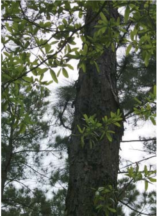
Photos 5 and 6. Examples of steep branch angle and a stem canker that would make that part of the stem not usable for a pole (stem below the steep branch or canker may qualify as a pole if there is enough length and no other defects).