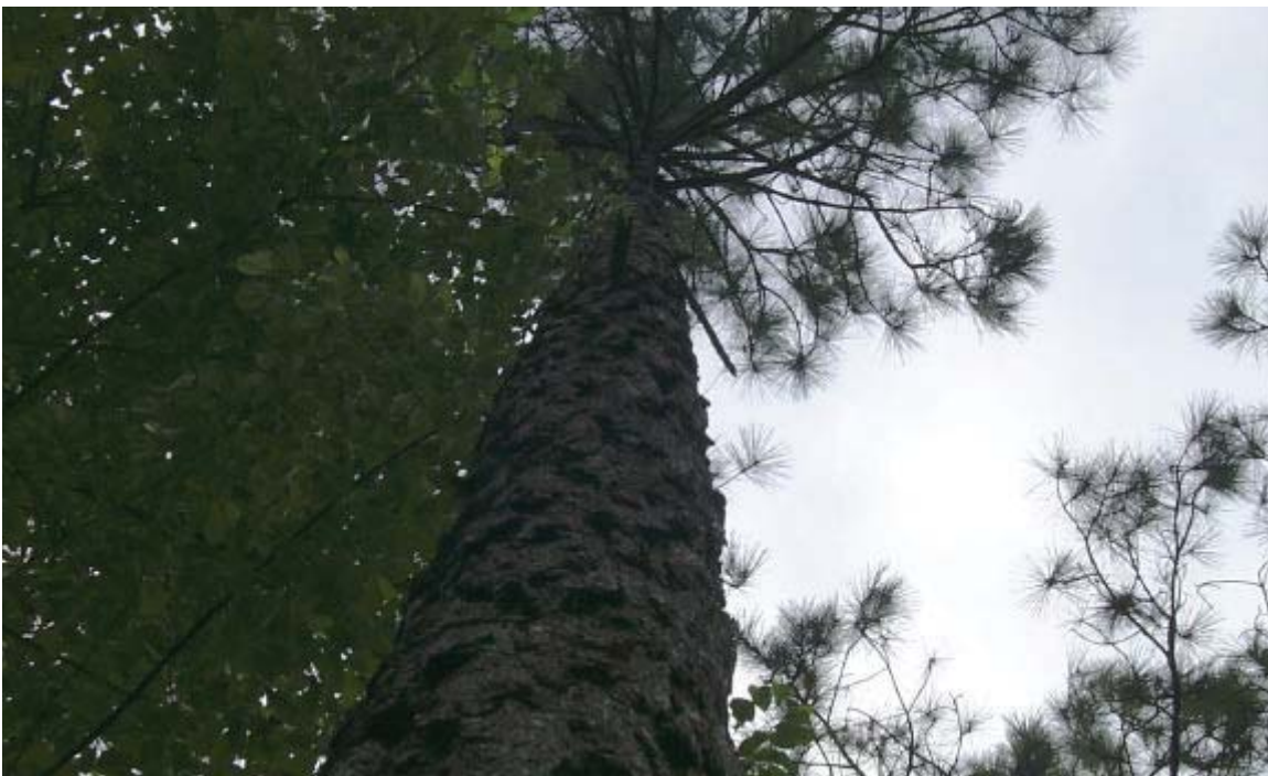
Photo 8. A potential pine pole with little sweep.