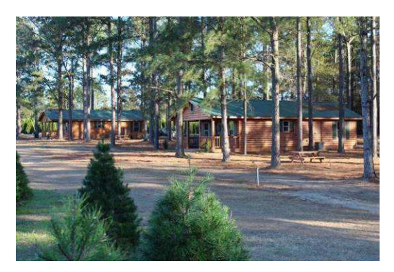
Fish River Trees, Summerdale, Alabama