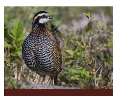
The bobwhite quail is a habitat specialist that is uniquely adapted to a particular array of habitats. An understanding of quail adaptations is a prerequisite to successful management.

Some wildlife are much more flexible, or "forgiving" if you will, and can successfully survive and reproduce in a wide array of habitat conditions. These animals are called habitat generalists . On the flip side, some wildlife species are specialists —those animals that only do best where a very specific type of habitat occurs. In the case of habitat specialists, even subtle changes in habitat conditions may cause the