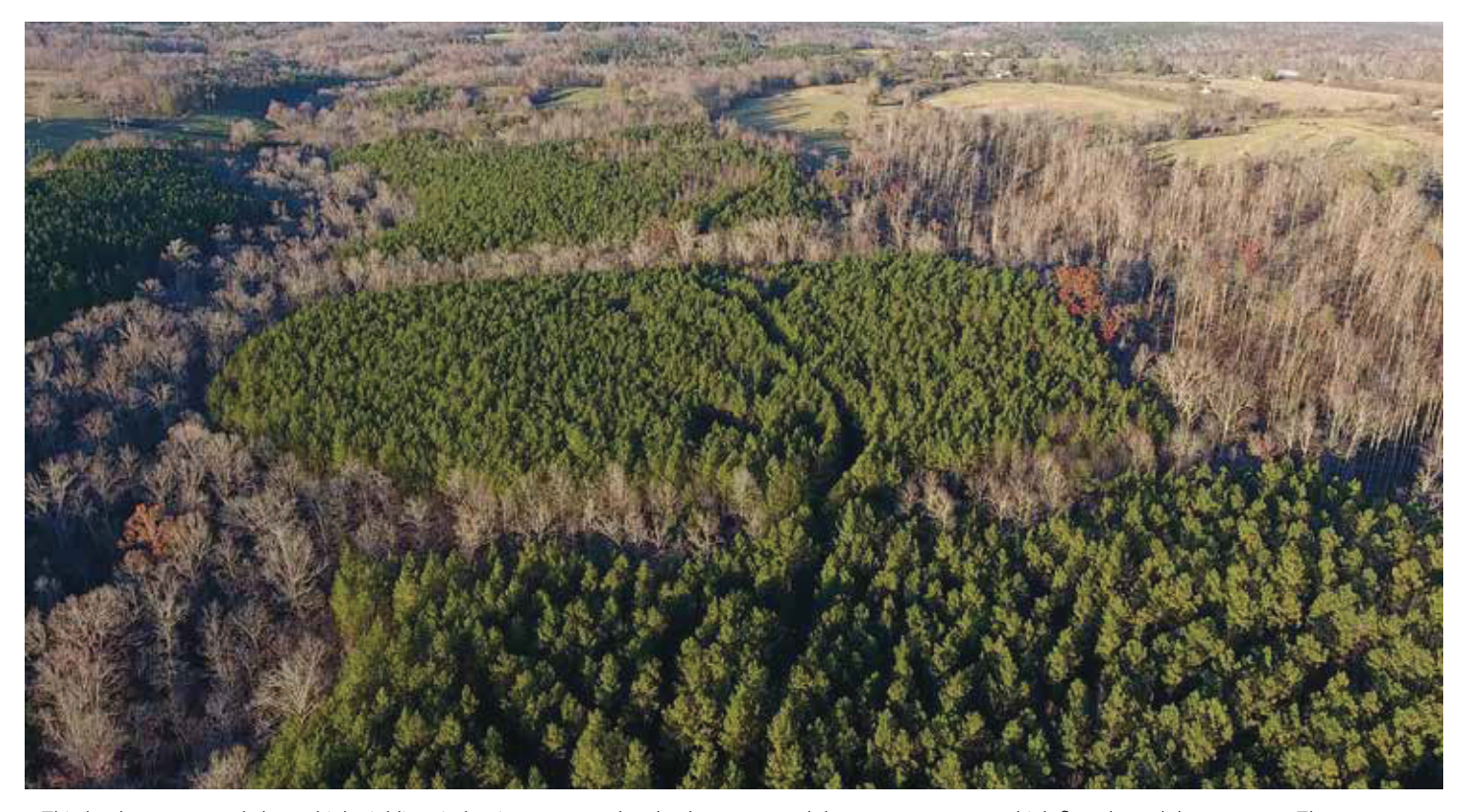
This landowner not only has a high-yielding timber investment, she also has protected the water resources which flow through her property. The gray areas are hardwood SMZs which were retained during the past timber harvest.

Revegetation/Stabilization. Some forestry-related soil disturbing activities require the establishment of a vegetative cover to stabilize mineral soil. The USDA Natural Resources Conservation Service can provide information on the site preparation, use of limestone and fertilizer, plant species recommendations, and the use of mulch for revegetating these sites. Finally, the best method of avoiding reactiva-