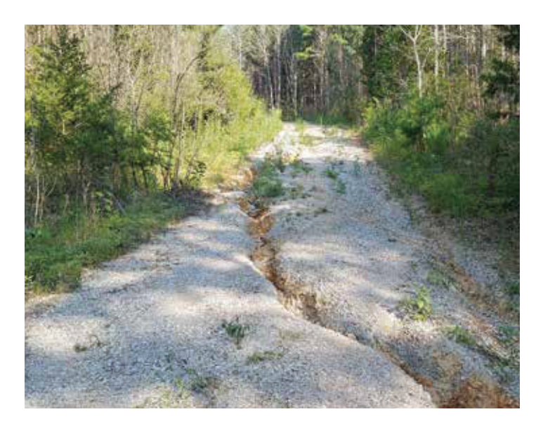
This landowner failed to require the implementation of BMPs in his timber sale contract. The road would likely still be passible and the adverse impact on water resources would have been much less had the road been stabilized according to BMPs.

tion of existing gullies is to neither operate in nor apply site preparation techniques to those areas.