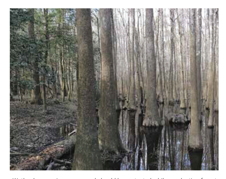
Wetlands are unique areas and should be protected while conducting forest management activities. Work with a registered forester to ensure that your efforts comply with the required U.S. Corp of Engineers Baseline BMPs.

The forestry community in Alabama has taken a proactive approach to avoiding degradation of the state's water resources. The Alabama Professional Logging Manager (PLM) program strives to improve the practice of sustainable forestry through training and education programs for loggers. While participation in Alabama's PLM is voluntary, it is encouraged by the Alabama Cooperative Extension System, Alabama Forestry Association, Alabama Forestry Commission and the Alabama Loggers Council. In addition, most forestland owners require the imple-