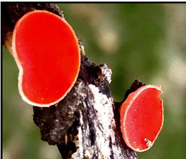
Sarcoscypha species