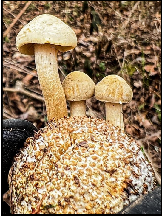
Left: Agrocybe species on a Sycamore seedpod Bottom: Neofavolus species