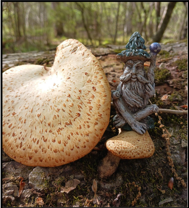
Cerioporus squamosus